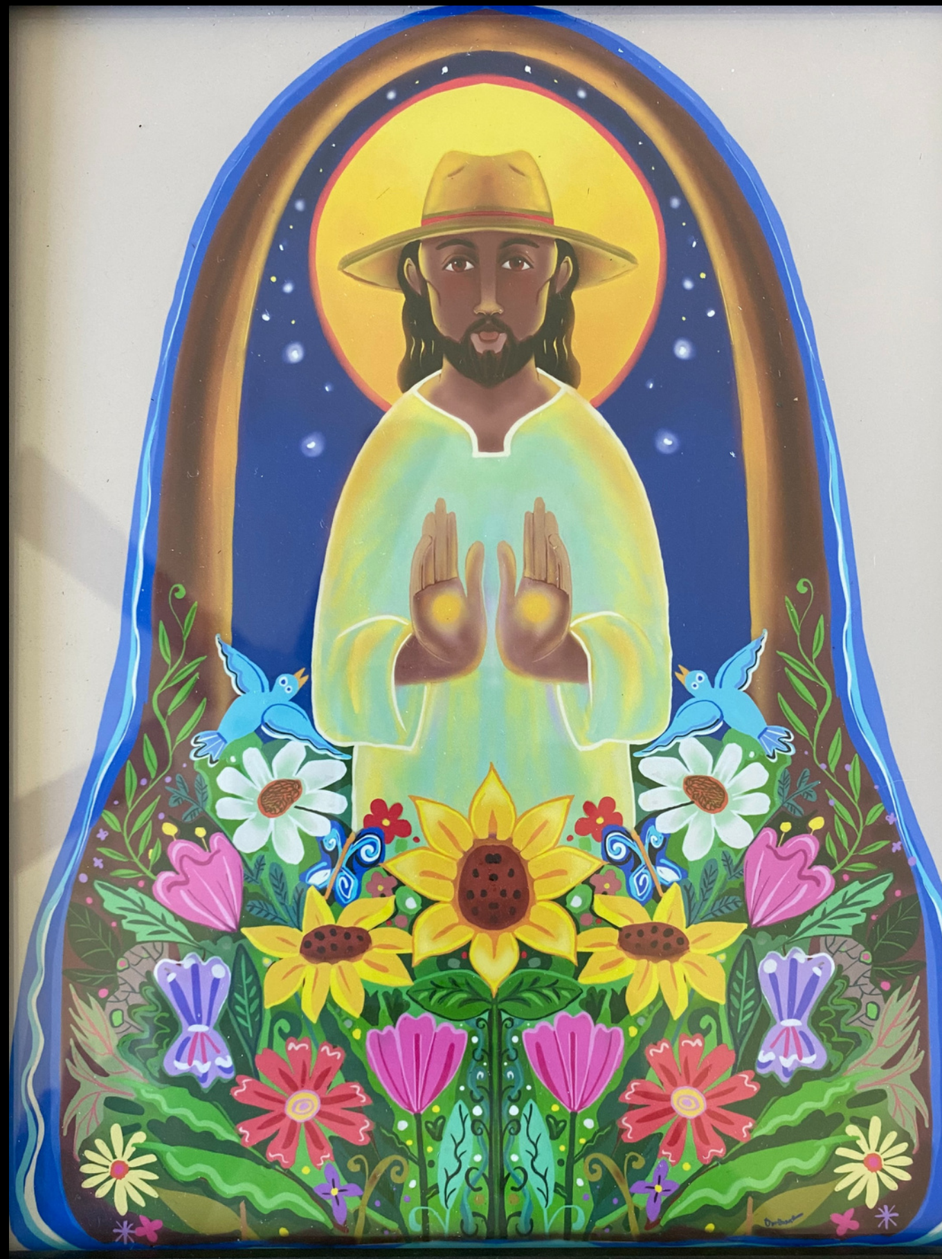
God, the Gardener